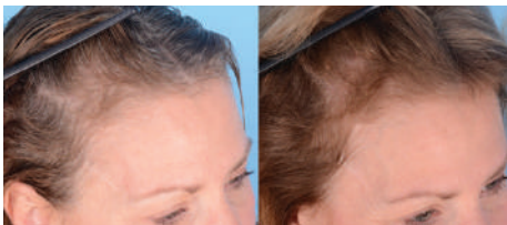
BEFORE 16 WEEKS