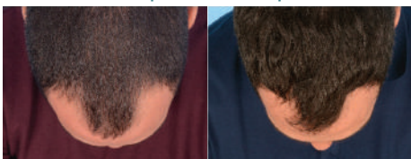
BEFORE 16 WEEKS