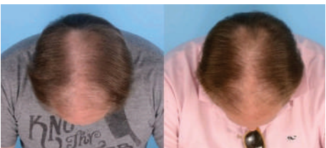
BEFORE 16 WEEKS